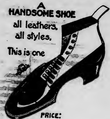
A HANDSOME SHOE all leathers, all styles. This is one